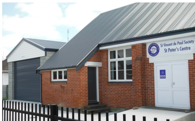
The front door of the St Peter's Centre is the entrance to the flat for family harm victims. The side doors give access to the storage and food handling areas.

All of these activities could happen without a resource consent because the zoning was residential. The main work that had to be done, other than building a garage and fencing,