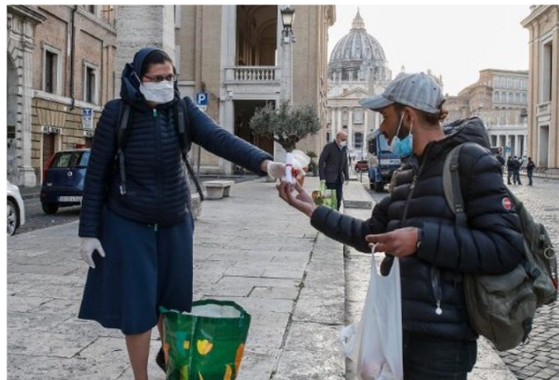
A volunteer from the Vincentians distributing food to the homeless near St. Peter's Basilica during the COVID pandemic

Today, the Vincentian Family includes over 100 branches of priests, brothers, sisters, and laypeople. No matter which branch they belong to, their mission remains the same: partake in and create charitable works and assist in the spiritual guidance and formation of the clergy and laity.