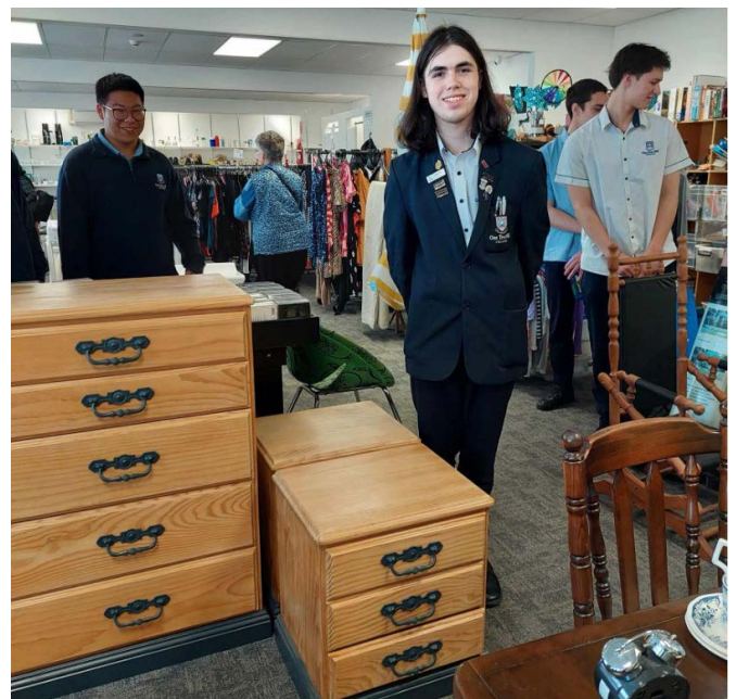
Some of the proud students with their finished furniture in the Vinnies Op Shop.

This initiative has been a resounding success, benefiting both Vinnies and the students. The shop receives beautifully restored furniture for sale, while the students gain valuable hands-on experience. With such positive results, there's hope that next year's class will be equally excited to take on new furniture restoration challenges.