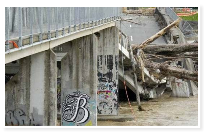
Pictured: Some of the devastation in Hawke's Bay

Continuing the theme from earlier AGM's, we listened to developers of the new religious education curriculum followed by an opportunity to develop practical skills. This time making rag rugs.