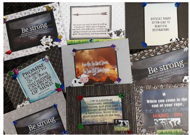
Above: Some of the cards sent to farmers.