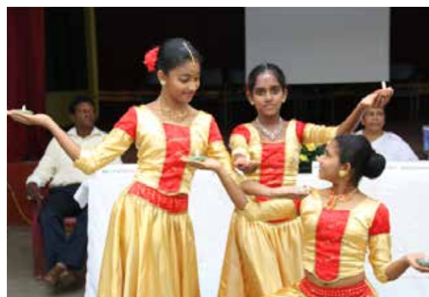
Candles held by the dancers in place of the traditional oil lamp.