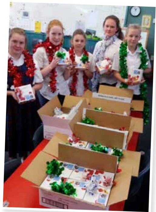
The Young Vinnies also did a big shop of over $1,000, which was donated to the parish. Some of the helpers wrapped the Christmas gifts.