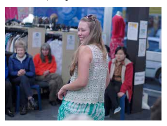
Model showing off the latest in-store looks.