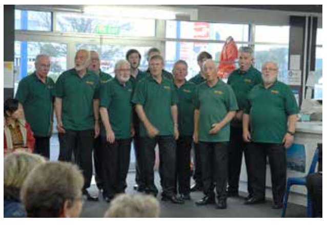
The Manawatunes providing the musical entertainment