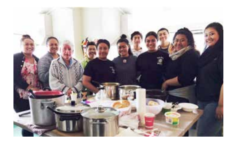
St Joseph's Conference, Otahuhu serving lunch to their community.

Local students from McAuley High School, the Catholic girl's college in Otahuhu, De La Salle College, the Catholic boy's college in Mangere, and Otahuhu College volunteered to help at the lunch, even taking soup to those living in the street who were unable to be there. The students have had the chance to see first-hand how SVDP can help those in need in their community. They have now joined the St Joseph's Conference, increasing numbers to 18.