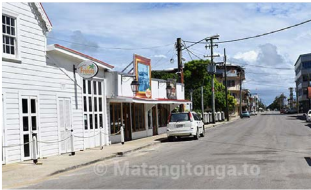
Empty main streets during lock down in Nukualofa

Those that do not pray regularly are now practicing it every day, absentees' fathers and mothers are now staying at home and get to know their families better, first time in my life to participate in a church service via live streaming,