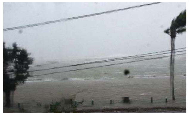
Tropical Cyclone Herold during King tide flooded the beachfront roads and villages in these areas.

TC Herold have complicated our preparation a little, but we will recover quickly to concentrate on the C-virus. We can get updates of the Pandemic via the local and international radio broadcasting services, tv networks, the internet and social media.