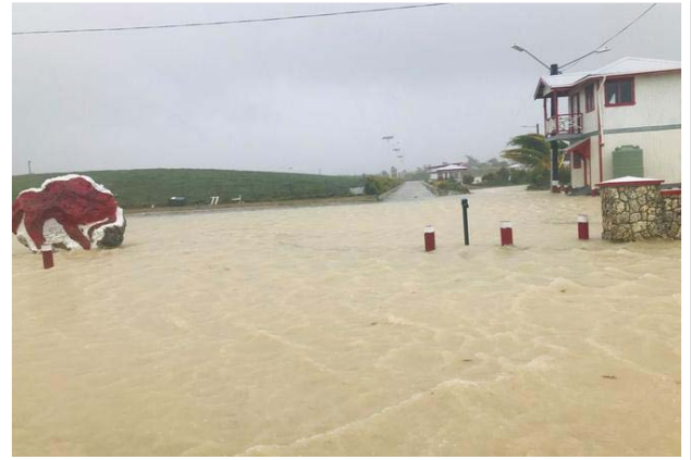
Tropical Cyclone Harold - a flooded street in Tonga.