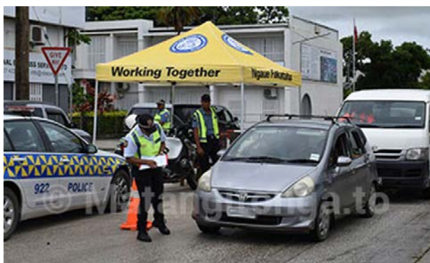
Check points in Nukualofa during lockdown.